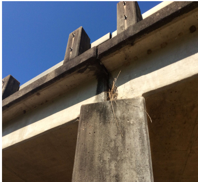
PHOTO 1 Description Bent 3 left side spall in corner of slab