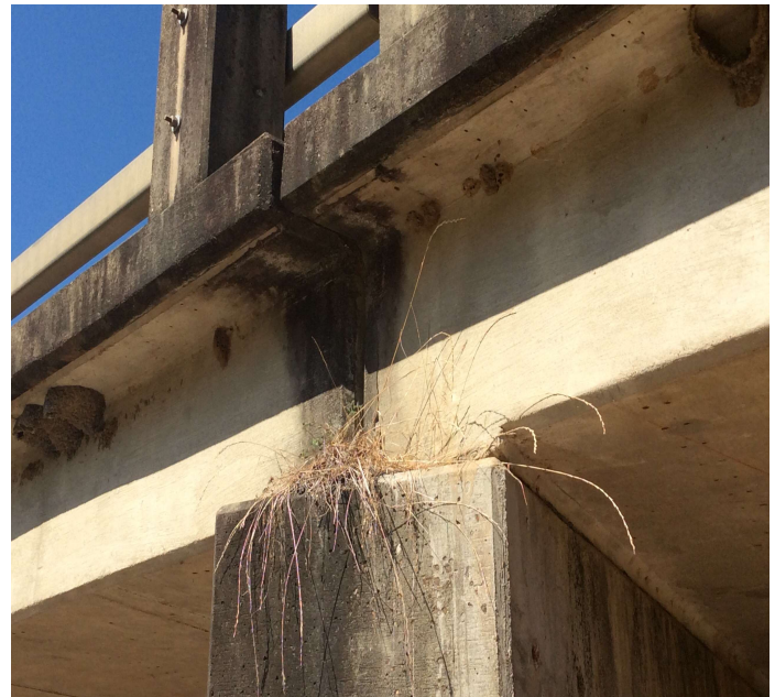
PHOTO 2 Description Bent 2 left side corner of slab